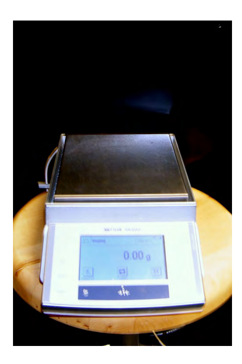
Figure 5: Top-loading weighing scale ('zero' scale before using)