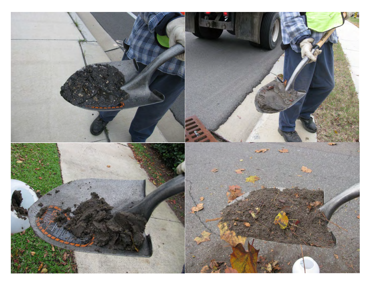
Figure 1: Visual indication of moisture content variability that can be observed in collected samples of solids that have been recovered during the MS4 study (can vary from dry to wet (top left)