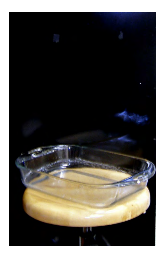
Figure 3: Pyrex baking dish for drying collected sample (clean and dry before pouring in sample)