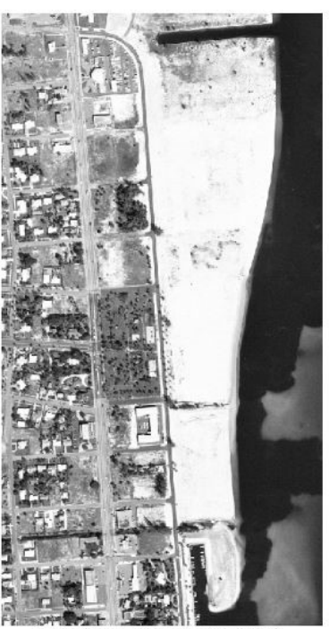
Lake Shore Drive Aerial, 1964